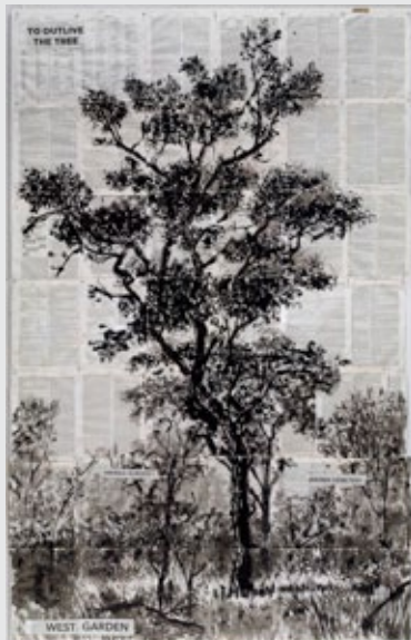
Indian Ink 179 x 116cm