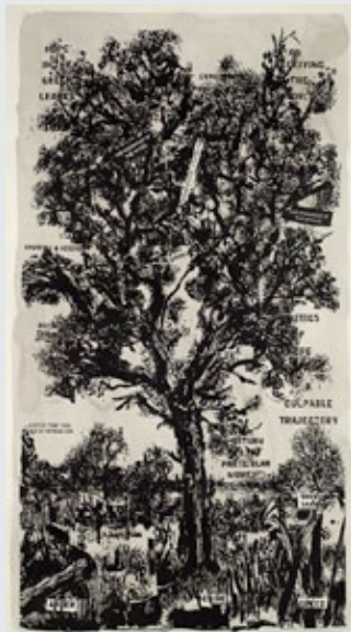
Linocut 185 x 102cm